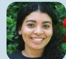
Genesis S - Age 23