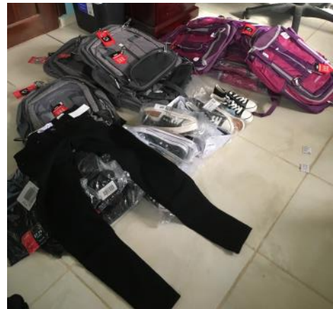
Blessing of School Clothes and Backpacks

There are still many fun teams and activities prepared for this summer. We ask for your prayers for those teams. We also ask for your prayers for the remaining funds needed for the remaining shoes, uniforms and supplies that still need to be purchased. We also need some more funding for a few other things that need to cover at the beginning of the school year such as work-books for our kids and a government required accident insurance. We would also like to find $50 per month sponsors to help us cover some of the monthly school expenses that we have. If covering any of these needs is something to you would like to be involved with, please contact our main office at 503-427-0258 or office@h2hcv.org .